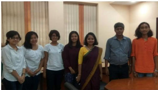
A and B: Group B (SDG4: Quality Education) interacting with students of La Martinere for Girls on 10/08/2018C C and D: Group A (SDG1: No Poverty) and Group D (SDG11: Sustainable Cities) interact with members of Bangla Natakdot.com on 10/08/2018