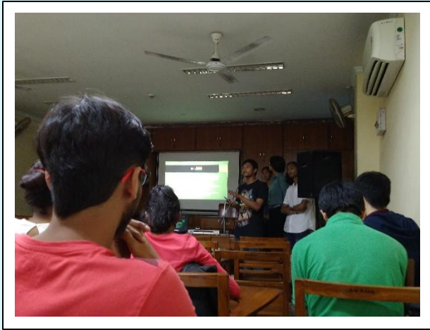
During the Final Presentation at RKM on 16/08/2018