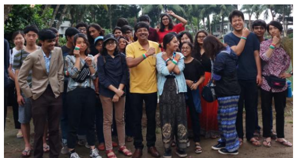
During the Village Visit on 14/08/2018