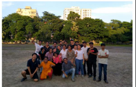
Scenes from the Cricket Match held in Vivekananda Park on 17/08/2018