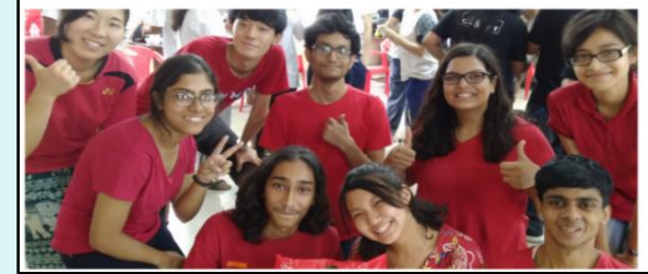
White and Red teams for Undokai on 11/08/2018