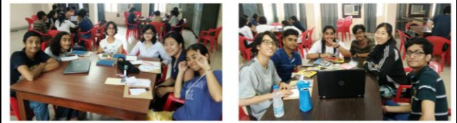
Top: NGO Visit on 9/08/2018 Bottom: Table Discussion on 8/08/2012