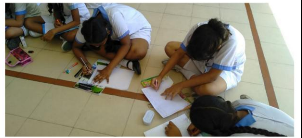
During the School Visit at Loreto Day School, Sealdah on 17/08/2018