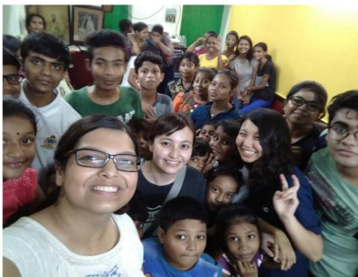
Group E (top) and Group C (bottom) during their company visit to JU, and Jabala Research Action Foundation respectively, on 10/08/2018.