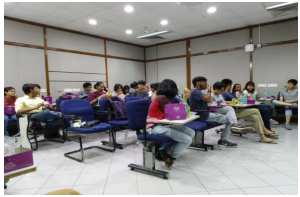
Lunch Time at Indian Statistical Institute on 13/08/2018