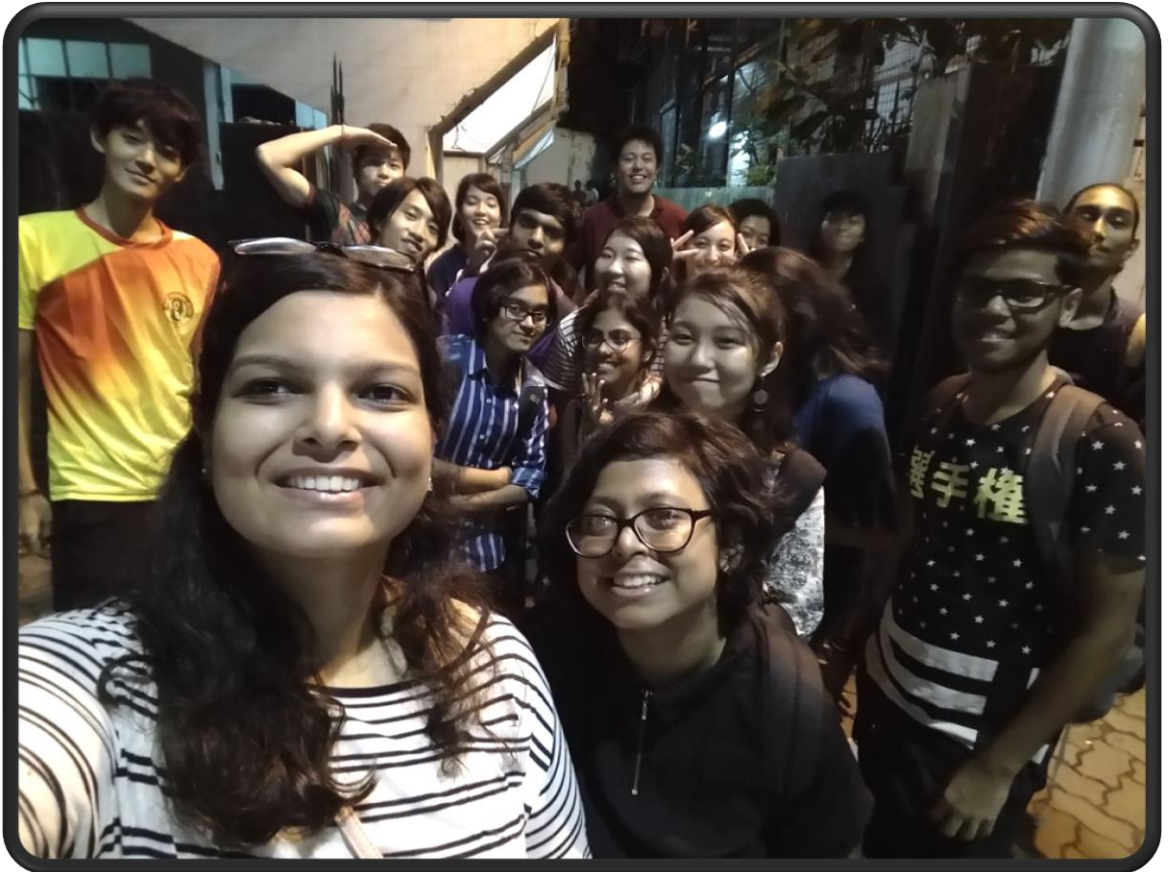
After the conclusion of the closing ceremony