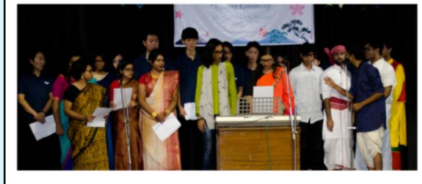
Some scenes from the Opening Ceremony held on 07/08/2018