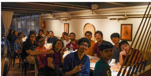
Scenes during the Sightseeing day held on 18/08/2018